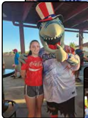
The Florida West Coast Chapter had a great night at the ballpark on July 4 with food, friends and fireworks.