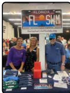
The Manasota Chapter at the IPSSA table top event where IPSSA raised $5,000 for the Florida Swims Foundation.

A huge round of applause to IPSSA Sarasota for raising $5,000 for the Florida Swims Foundation and the Every Child