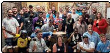
Broward Chapter held an Axe Throwing Networking Event in June and had a great time.

August 16 the Chapter is offering an advanced module CE course on pool updates for free at HornerXpress – Fort Lauderdale. Please RSVP to FSPABroward@FloridaPoolPro.com.