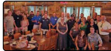
The Florida Gulf Coast Chapter held an axe throwing event in July.

Mark your calendar for our September meeting which will be held at Famous Dave's BBQ in Fort Myers on Wednesday, September 13 at 6:30 p.m. Symbiont Service Corp will be hosting this meeting and more details will follow.